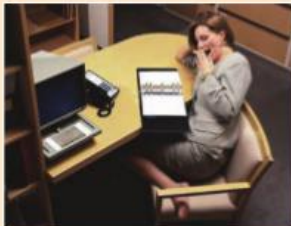
She is working hard these days. (Right now she is not working. She is yawning.)