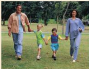
They are walking in the park now.